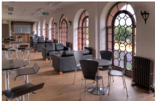
Adult Bar 'The Orangery'