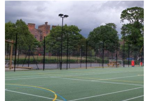
All weather sports pitches