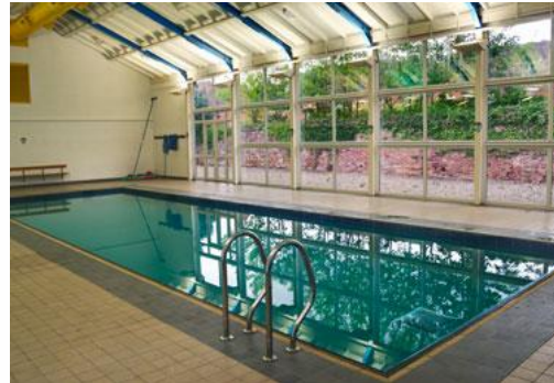
Indoor swimming pool