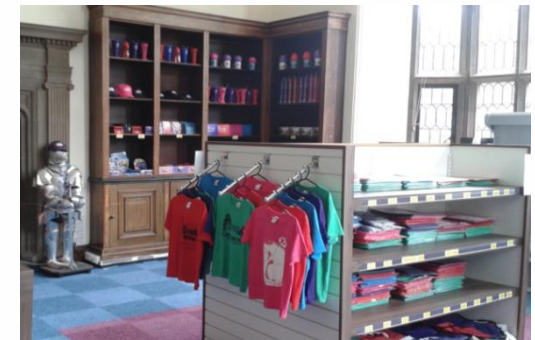
Tuck shop/gift shop