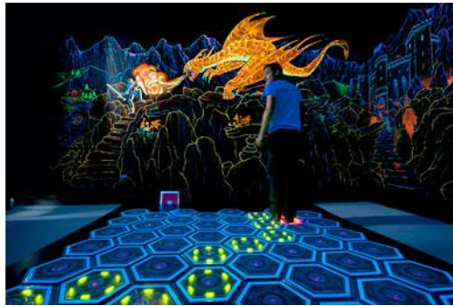
Grid of Stones