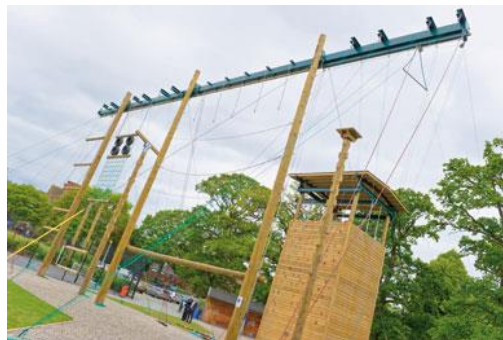
High rope course